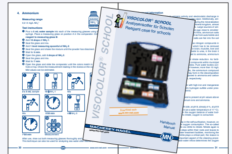
Extensive manual with valuable background information

Optionally, the case can be equipped with a pack of pH-Fix or QUANTOFIX® test strips as well. Thus, the VISOCOLOR® SCHOOL reagent case is the ideal tool for projects revolving around water and water analysis in any science class.